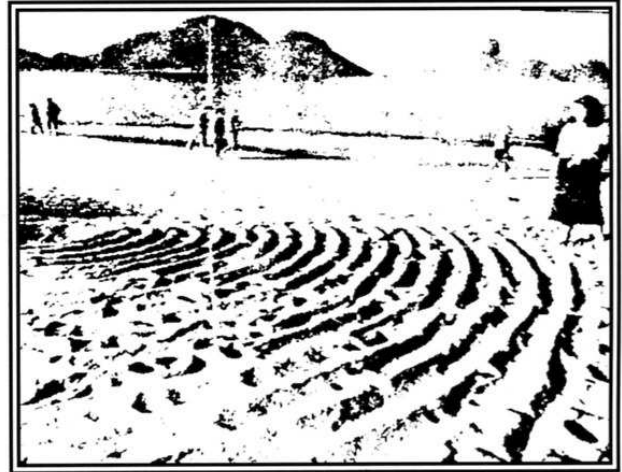
Fig. 1. Aleida Machao and the circles in the sand

Early on that same day, TV Globo telephoned to me and invited me to their studio to watch their programme on the monitor. As I watched, I felt impressed by the perfection with which the circles had been incised in the sand at Icaraí. Had the sand been wet , then conceivably some talented human might have managed to contrive it somehow.